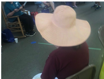
We had fun wearing hats at the Rock-a-thon. Who is under this hat?